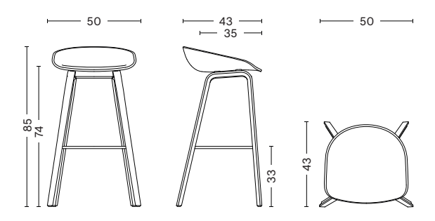
W50 x D43 x H85 cm Seat height 74 cm, Seat depth 35 cm