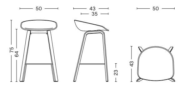
W50 x D43 x H75 cm Seat height 64 cm, Seat depth 35 cm